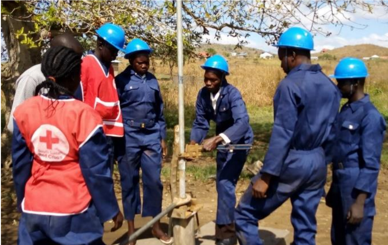
SSRC Volunteers and County mechanics carrying out hand pump repair in Nimule on the 17 December 2019

During this year, the WASH department continued with implementation of project activities under long term and developmental intervention in Kuajok, Ikwoto, Wau, Tonj North, Bor, Rumbek, Terekeka, and Juba while emergency response support in Yirol, Aweil, Terekeka and Wau