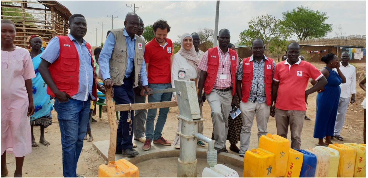
A photo of SSRC, TRC and ICRC Staff led by SSRC SG during the official hand over of the newly drilled borehole in Jebel Yesua residential area-Photo taken by Communication Officer on 1 April 2019.