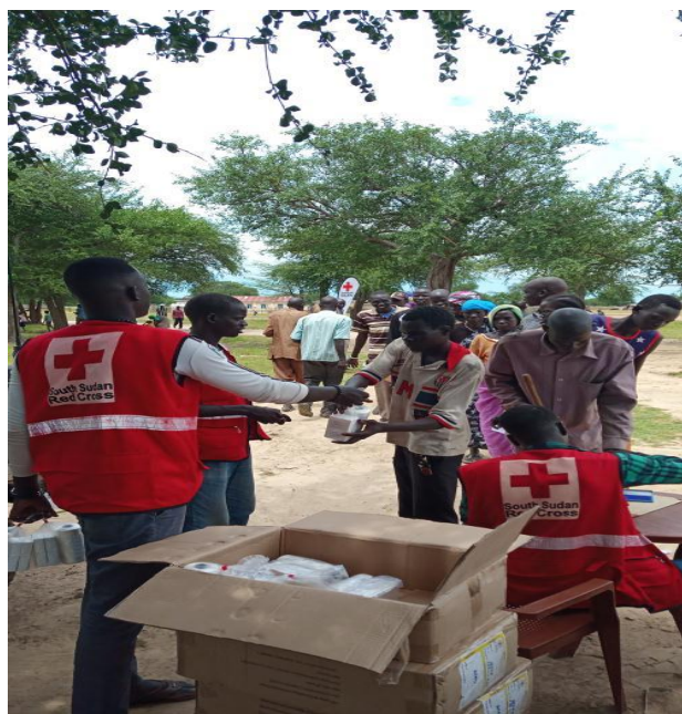
SSRC Volunteers and Staff Distributing Light Fishing Kits to Beneficiaries in Twic; 3 October 2019

In 2019, the national society reached 21,561 (13,121 female and 8,440 male) people with Disaster Risk Reduction programming and early action activities and 7,480 (5,114 female and 2,366 male) people with livelihood support (fishing kits, seeds and tools). A total of 3,404 (2,403 female and 1001 male) people received NFIs.