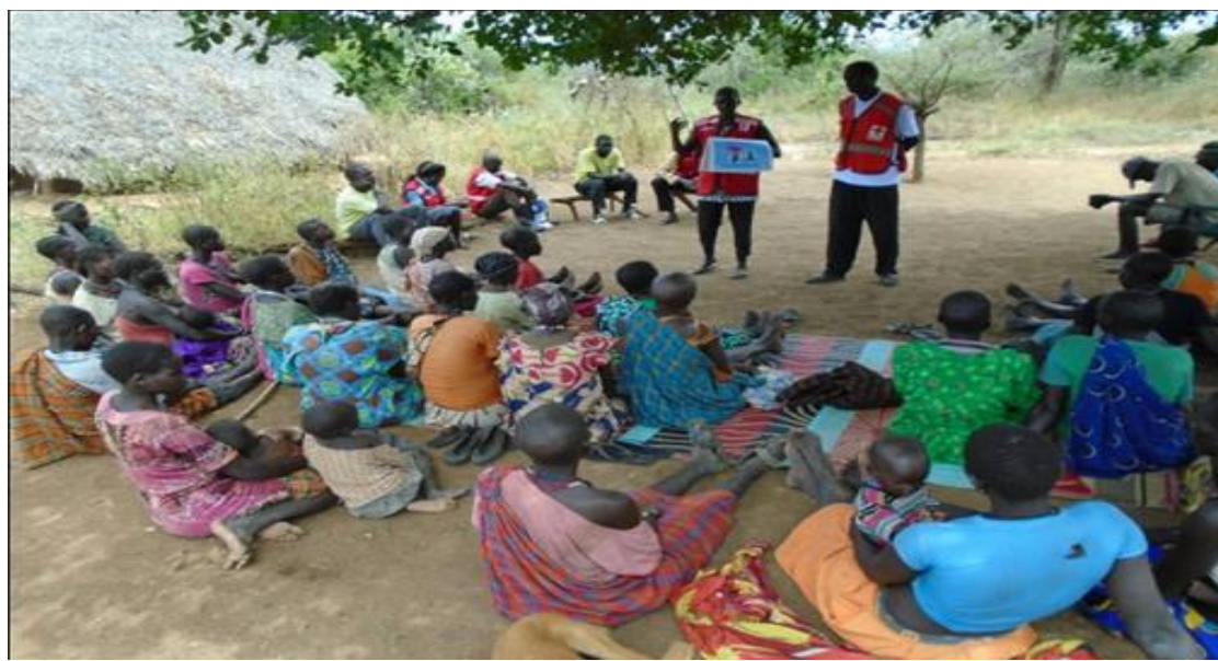
Measles awareness by SSRC volunteers in Madweny village -Ikwoto on 21 November 2019

439,890 (254,278 female and 185,612 male) people reached with Health Promotion Messages